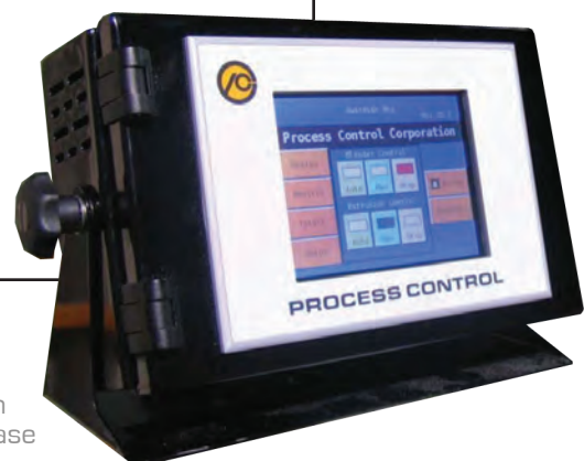
Guardian Color Touch Screen with Rotating Base