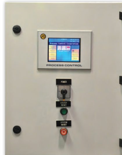
Autobatch Control Panel Upgrade with Color Touch Screen

Process Control offers a new touch screen controller for Autobatch and Guardian® blenders that is an off-the-shelf solution to improve your blender's performance and longevity. This non-proprietary upgrade will not only add years to your blender's life, but it will actually improve your blender's accuracy and output as well. The upgrade is also a way to simplify the blending process and postpone future blender replacement, which makes things easier and saves you money all at once. Your older Autobatch or Guardian® controls are facing the threat of becoming obsolete; ensure that will not happen by upgrading to our new touch screen control system today.