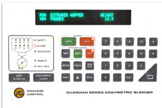
Old Operator Interface