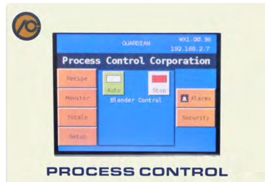
New Operator Interface