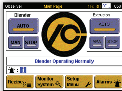
New Operator Interface