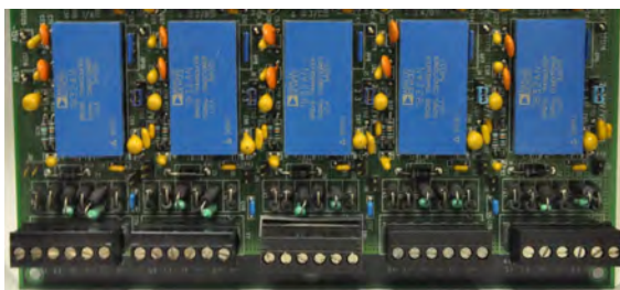
Old Weigh Module Chips

Note: Prices for Weigh Module Upgrade kits are available upon request to PCC.