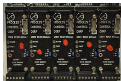
New Weigh Module Chips