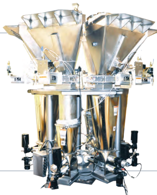
XU Series Continuous Gravimetric Powder Blender

Process Control offers a new selection of upgrades for Continuous Gravimetric blenders, including a color touch screen controller, brushless motors and drives, and a DSP weigh module upgrade kit, that will improve your blender's performance and longevity. These upgrades not only add years to your blender's life, but can actually improve your blender's accuracy as well. These upgrades offer a way to simplify the blending process and postpone future blender replacement, making operation easier and saving you money all at once. Your older Continuous Gravimetric blender controls, drives, and weigh module chips are facing the threat of becoming obsolete; ensure that will not happen by upgrading today.