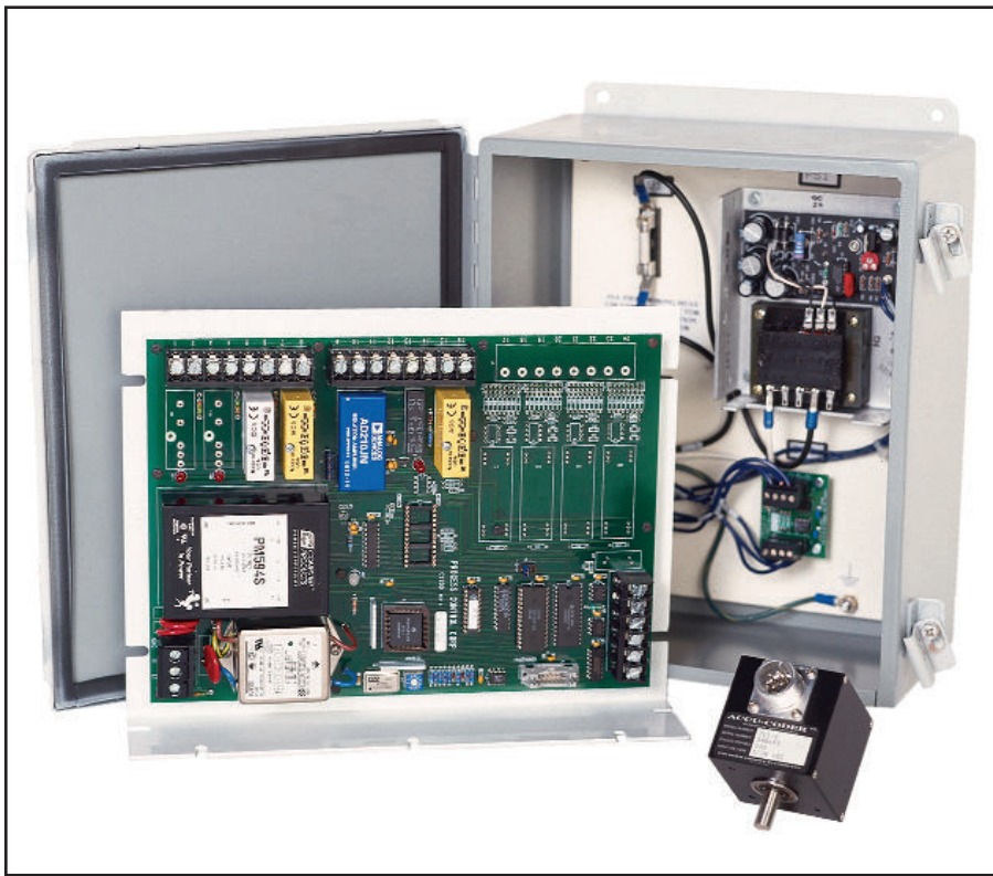
The Gravitrol® System: complete gravimetric extrusion control via drive speed control and line speed control (Pictured above is an EXL card with pulse generator and encoder)

Process Control's Gravitrol® Gravimetric Extrusion Control Systems automates the control of any extrusion line – coextrusion or monoextrusion – on the basis of weight.