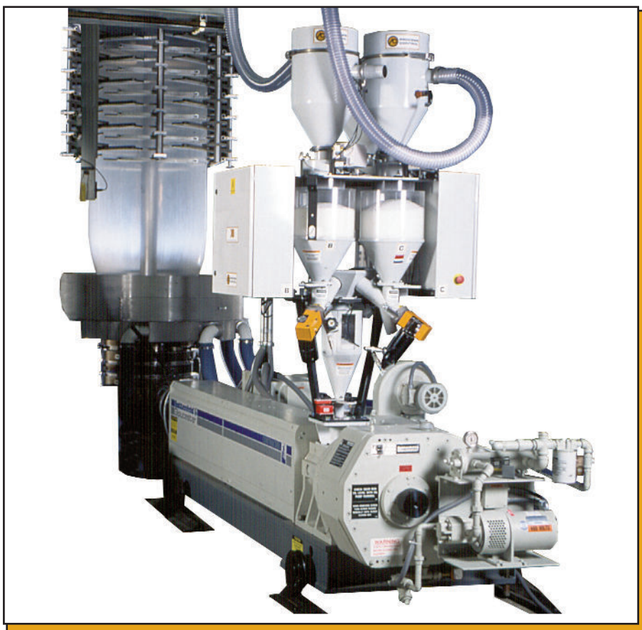
X Series blender with extrusion control: Proven Gravitrol® gravimetric extrusion control and blending in one integrated, easy-to-use package.

PROCESS CONTROL "X" Series blenders can be equipped with extrusion control software to allow the blender to control the extruder and line speed on monoextrusion lines for consistent output by weight. The only additional hardware needed is an EXD extruder drive control module and, if line speed is to be controlled, an EXL line speed control module.