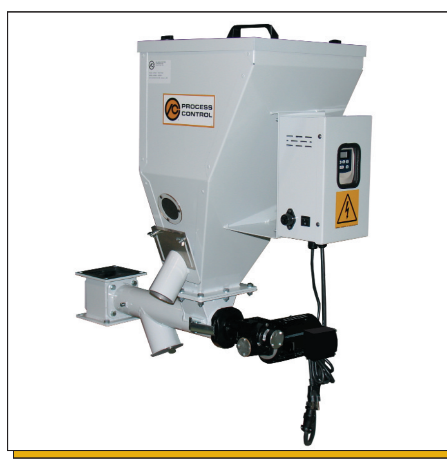
The AFV Series: Precision Volumetric Additive Material Feeder (shown above with central mounting adapter)

The AFV Series Volumetric Additive Material Feeder from Process Control is designed to inject color concentrates or other additive-type materials directly into a material stream at the feed throat of an Extruder or molding machine. The AFV Series is a simple, easy to operate feeder, offering unparalleled accuracy and cost savings to plastic processors.