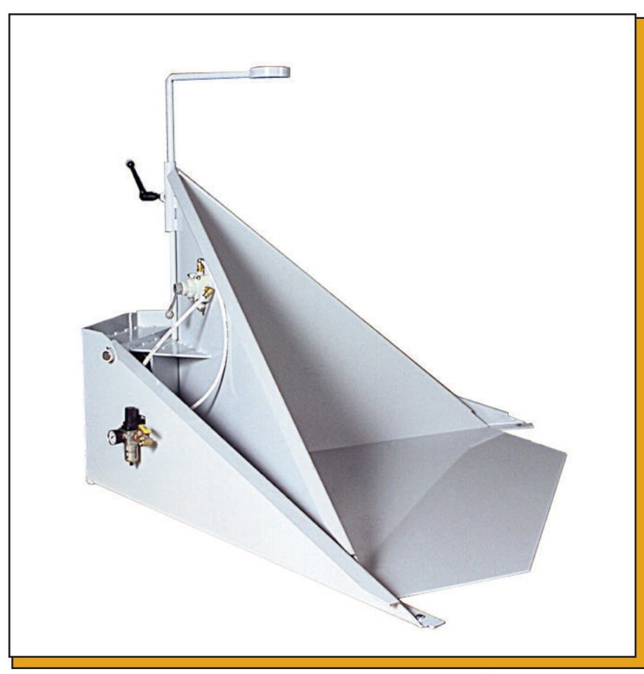
The PT Series: smooth tilt action with easy on & off placement

Process Control's PT Series Floor Level Box Tilter is an easy-to-use gaylord container tilter which offers fork truck, pallet jack, or hand truck loading of bulk containers. Its rugged construction and reliable operating assemblies assure long lasting, dependable operation. By adjusting the PSIG on the air bag to a prescribed setting, a constant pressure slowly lifts the Gaylord automatically as it empties and becomes lighter. This action moves the material to the corner and allows the pick-up lance to completely empty the