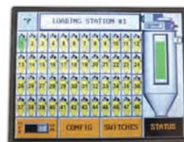
Director Sequencing Panel