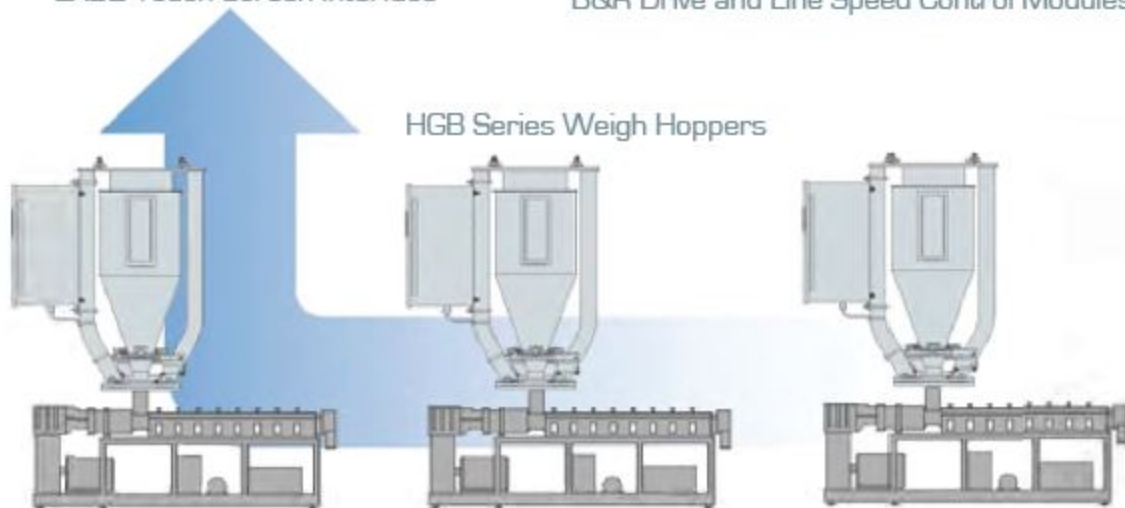
HGB Series Weigh Hoppers

Process Control offers a new selection of upgrades for Gravitrol, including a color touch screen controller, B&R Drive Module & Line Speed Control Module, and a DSP weigh module upgrade kit, that will improve performance and longevity. These upgrades not only add years to your Gravitrol's life, but can actually improve your accuracy as well. Additionally, the upgrades offer a way to simplify the process and postpone future replacement, making operation easier and saving you money all at once. Your older Gravitrol systems controls, drive modules, and weigh module chips are facing the threat of becoming obsolete; ensure that will not happen by upgrading today.