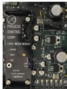
New Single Weigh Module Chip