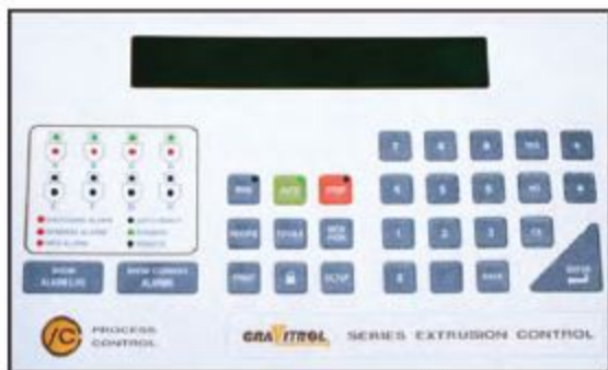
Old Gravitrol Interface