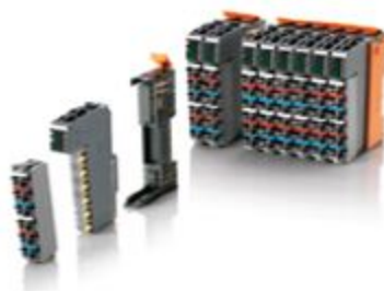
B&R Drive & Line Speed Control Module