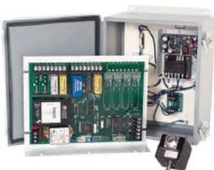
Old EXD/EXL Drive Module