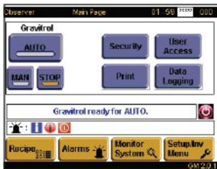
EXB2 Touch Screen Interface