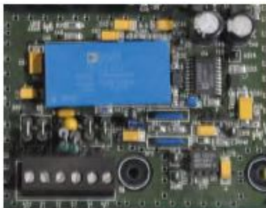
Old Single Weigh Module Chip