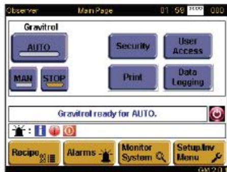
New EXB2 Interface