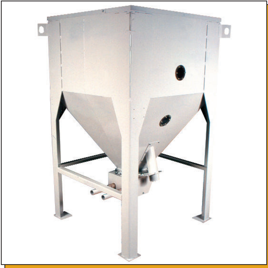
HS Series: Economical, space saving in-plant storage bins for finished or raw materials.

The HS Series Surge Hoppers from Process Control are ideal for in-plant storage of both raw materials and finished product. They are available in a variety of sizes and capacities to maximize and conserve handling time, space, and energy. Standard capacities range from 30 cu.ft. to 290 cu.ft. and are available with hopper slopes of 45° or 60° depending on the flow characteristics of the material being stored. Custom designed bins with 70° hopper slopes can also be supplied for regrinds or difficult flowing materials.